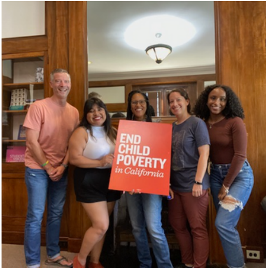
GRACE team posing at the quarterly staff retreat in October.