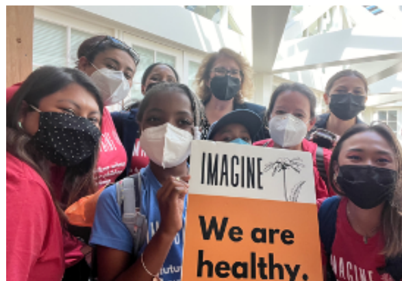
GRACE (and friends) after the Select Committee on Poverty hearing in June.