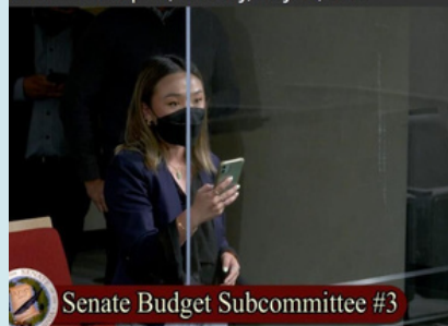
Senate Budget Subcommittee #3

AND FISCAL REVIEW SUBCOMMITTEE NO. 3 ON HEALTH SERVICES: 1:30 p.m., Tuesday, May 10, 2022